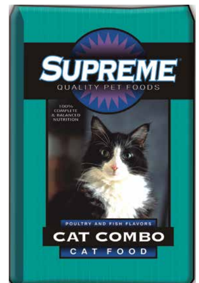
Supreme Cat Combo Food is available at G. & E. Pharmacy