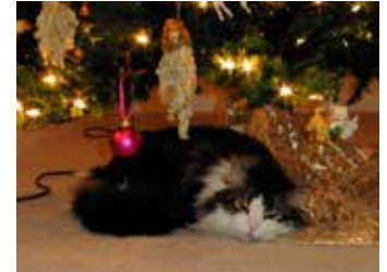
Waiting for my presents

Happy sub-arctic Tuesday. Brr...it's cold out there. We put up our Christmas tree on the weekend